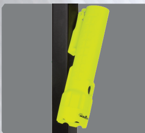
Hands-free magnet in pocket clip