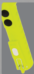
Built in pocket/ belt clip with integrated magnet