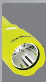
High-efficiency deep parabolic reflector